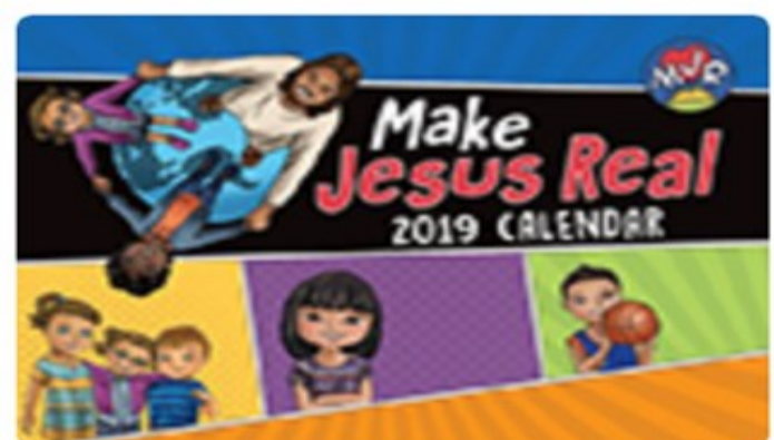
MJR 2019 Calendar